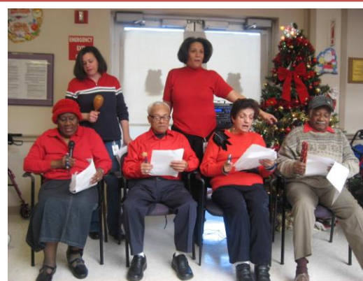
CHRISTMAS 2010 CONCERT ADULT DAY CARE