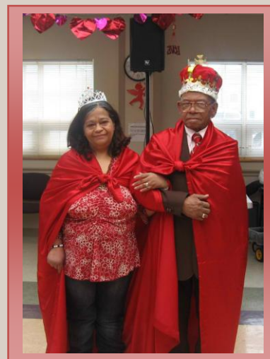
ADULT DAY CARE